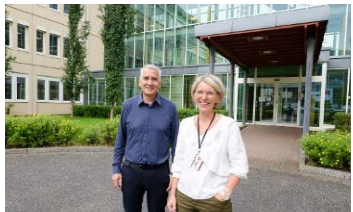
Photo: Employees outside the offices of the NCA and NAV

Website: Information in English (nav.no)